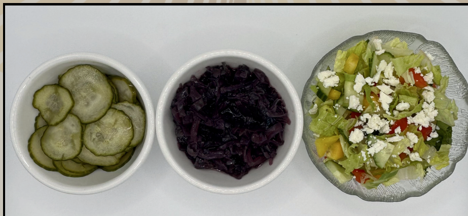
AUGERKESALAT, RØDKÅL, GARDEN SALAD